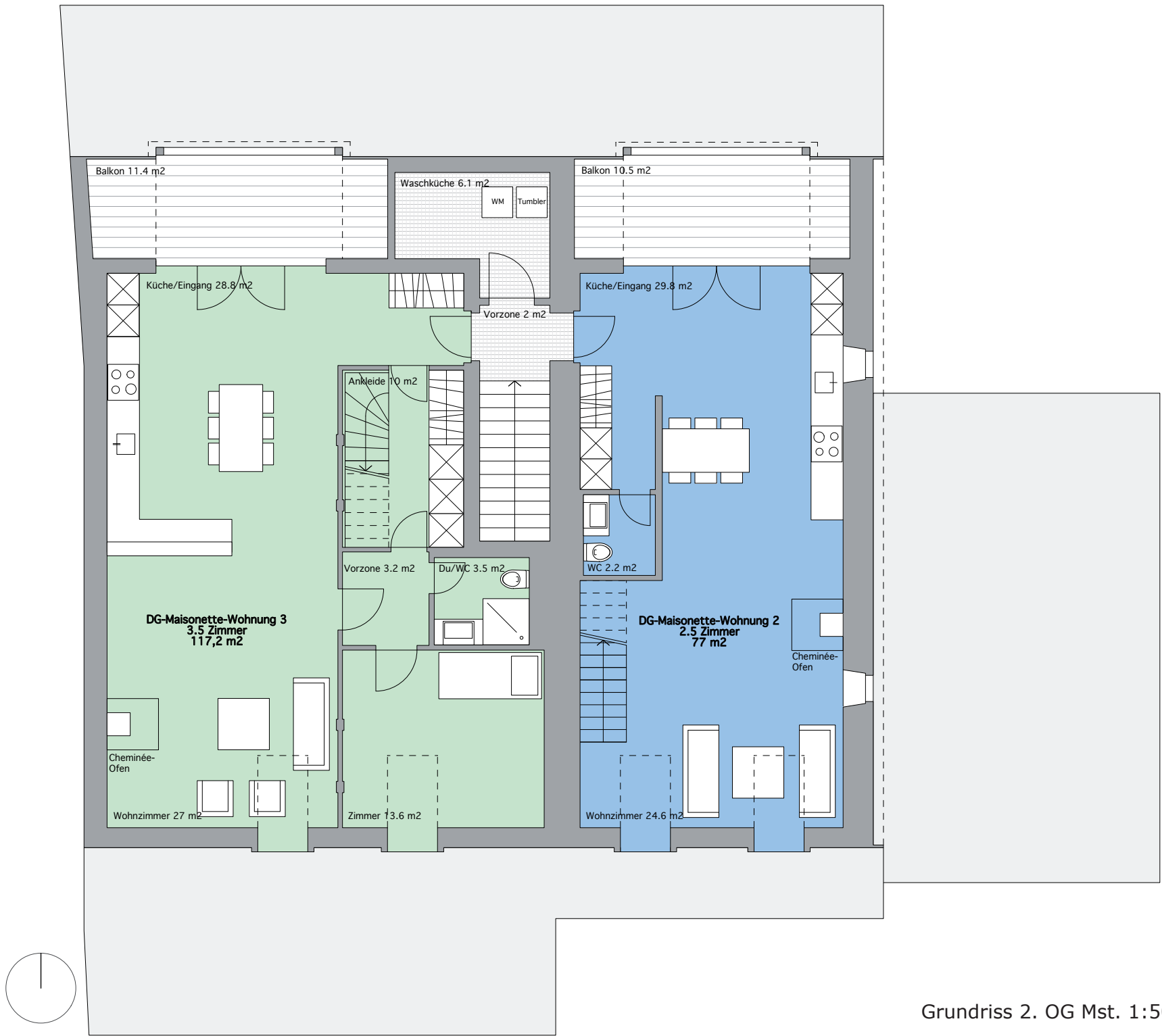
Grundriss 2. OG Mst. 1:50