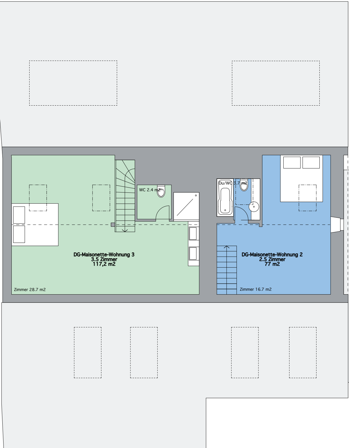
Grundriss DG Mst. 1:50