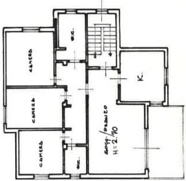
PISO TERRA H = 2.70 mt.